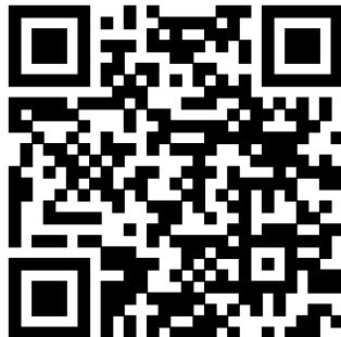
56-1 One Report